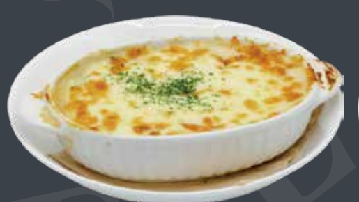
■Shrimp gratin ¥1,090