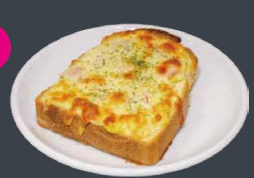
■Bacon eggpizza toast ¥640