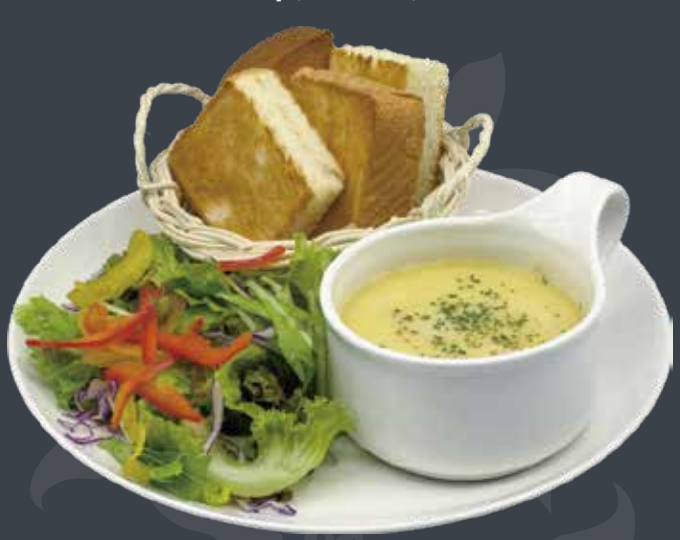
■Salmon soup ¥1,320