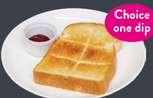
■Thick sliced toast ¥400