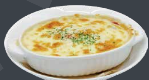
■Salmon gratin ¥1,150