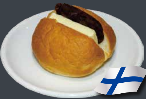
■Japanese Azuki bean paste pulla ¥420