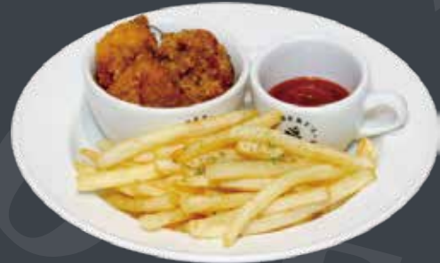
■ Fried chicken& French fries ¥880