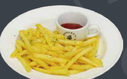
■French fries ¥610