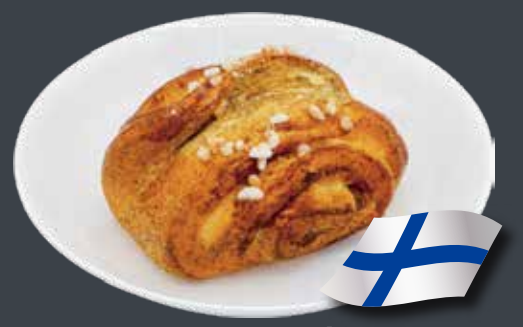
Homemade cinnamon rolls