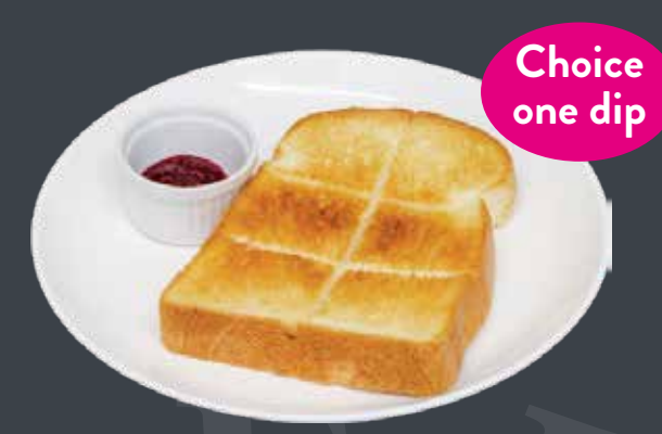
■Thick sliced toast ¥410