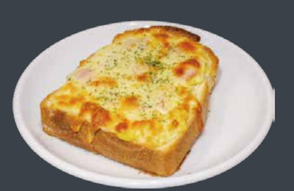
■Bacon eggpizza toast ¥650