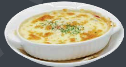
■Salmon gratin ¥1,160