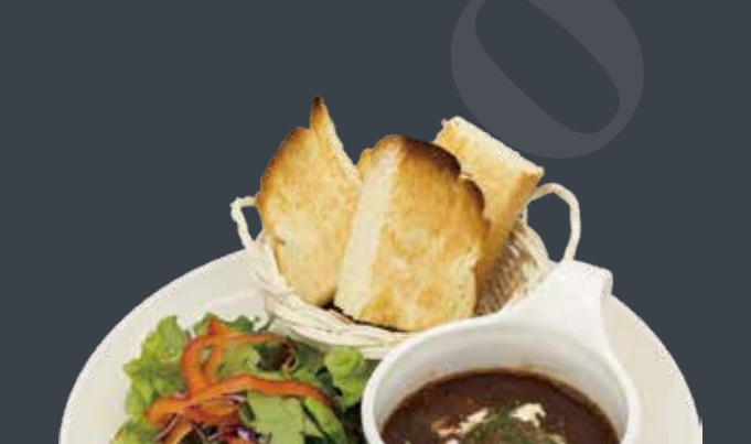
■Beef stew ¥1,290