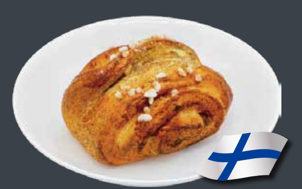
■Homemade cinnamon rolls ¥470