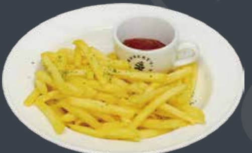
■French fries ¥630