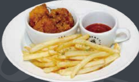
Fried chicken& French fries ¥900