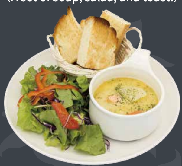
■Salmon soup ¥1,330